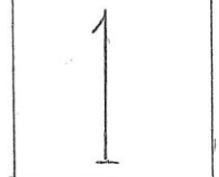
Plot Plan 1"=100'-0"